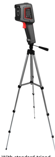
With standard tripod interface, can be equipped with customer's own tripod.

GUIDE T120H Fever Screening Thermal Camera is a fast temperature detection tool, which can be used to detect human temperature from a safety distance with accuracy of \pm 0.5^{\circ}\text{C} . It is an economical and practical thermal camera that could meet the needs of primary temperature screening well. GUIDE T120H is not only suitable for flexible temperature screening, but also can be deployed at the entrances and exits of the public area, which makes it an ideal device to improve the efficiency of epidemic prevention and protect public health.